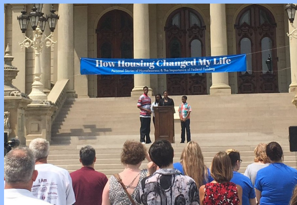
People rally at the Capitol to end homelessness.